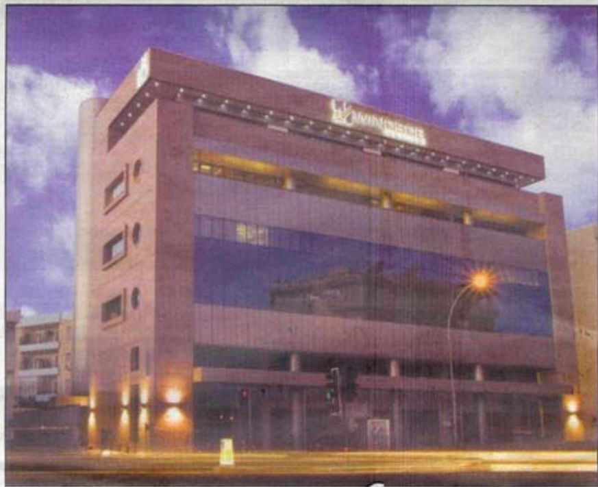
The Windsor Broker's Business Centre